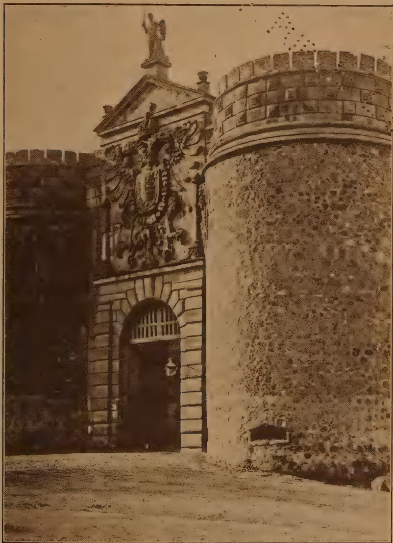
THE VISAGRA GATE